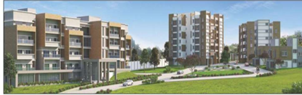
GUEST HOUSE & STAFF HOUSING