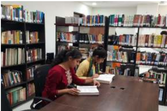
Fig: Library and Smart Classrooms