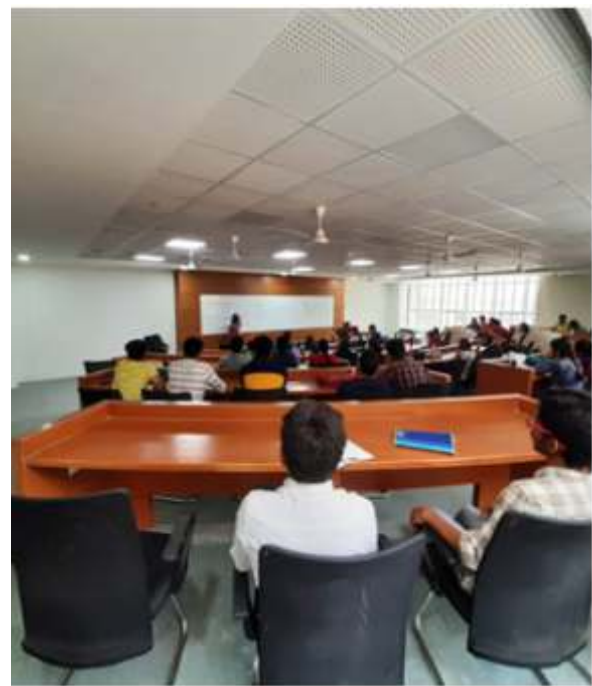
Smart Class Rooms with Projectors